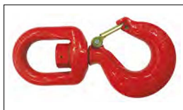
Safety: homologated self locking swivel hook

* Hook speed without load ** without stand