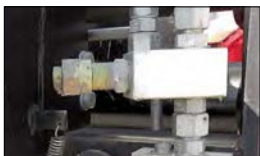
End of cable/ hook upper position automatic movement stop